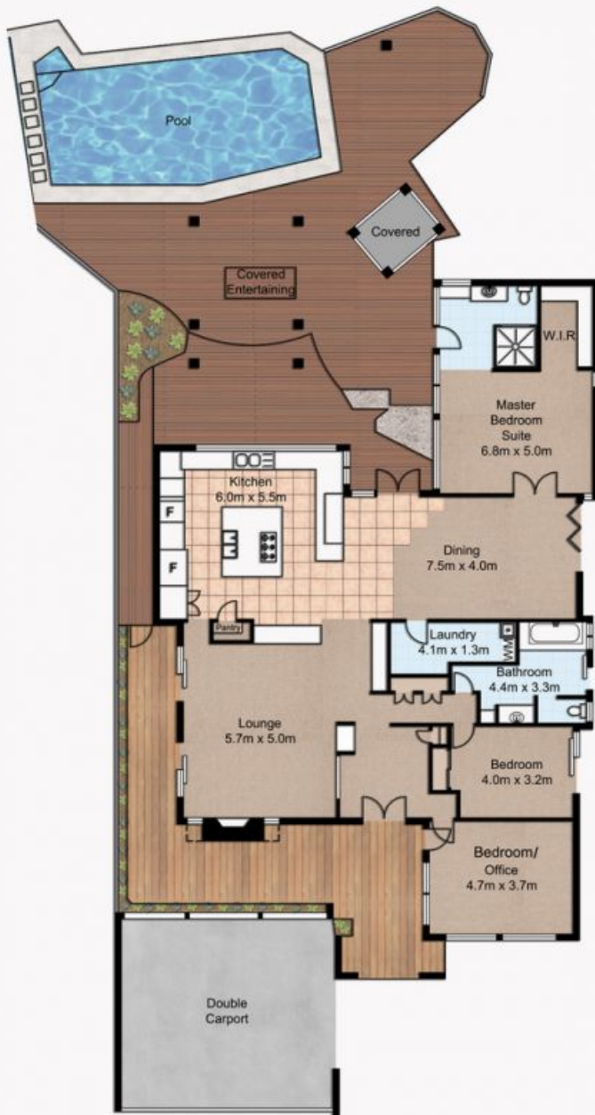
Main Dwelling Approximate Floor Area 283 SQ.M